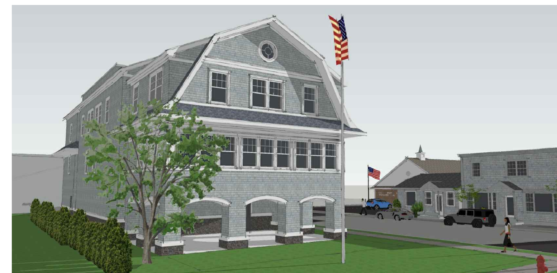
VIEW LOOKING SOUTH EAST