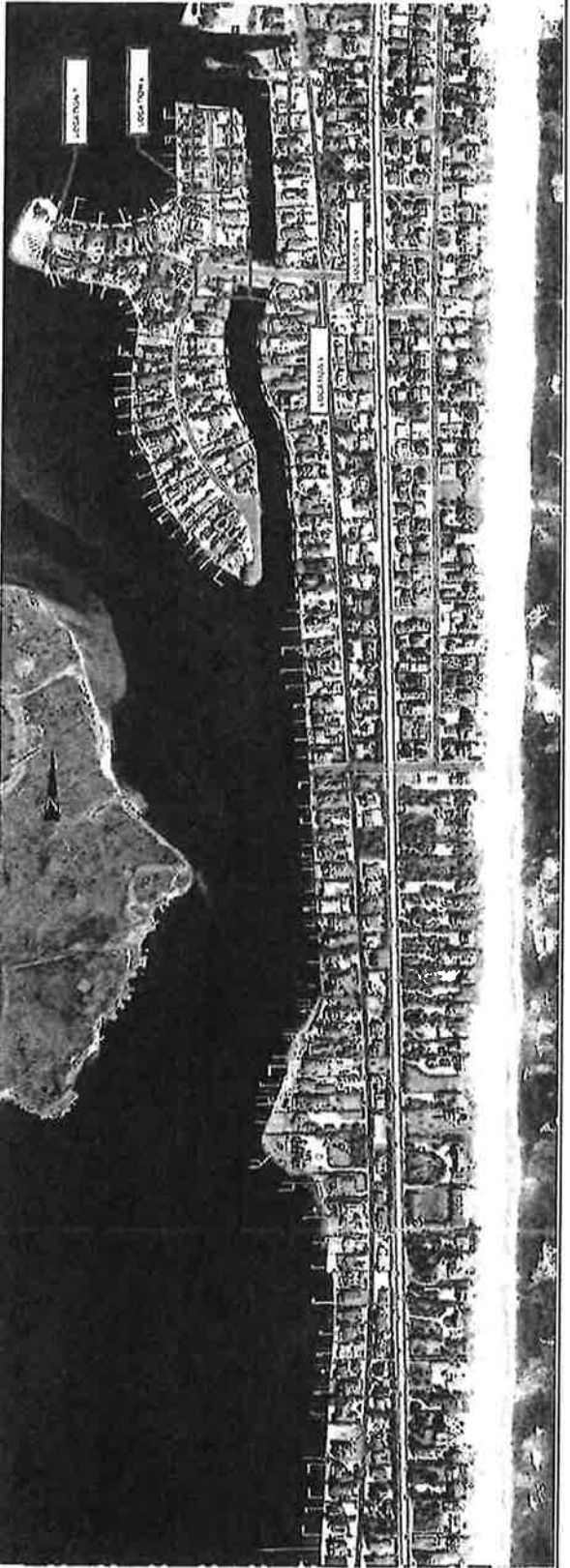
MATCHLINE A - A (SEE ABOVE)

DATE: 10/15/10 DRAWN BY: [illegible] CHECKED BY: [illegible] SCALE: [illegible]